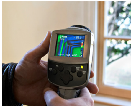
INFRARED CAMERA INSULATION TEST