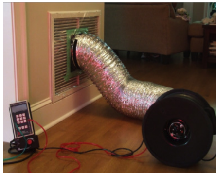
DUCT TIGHTNESS TEST

Southern Development's homes undergo more in depth testing than any other builder in the Central Virginia area which translates to increased peace of mind for our homeowners, now and for years to come.